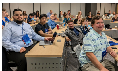
Project team at Digital Humanities 2024 Washington, D.C.